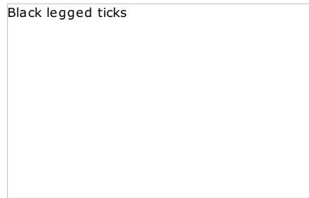
Photo composite from the State Department of Health Services shows the sizes of the Western black-legged tick. From left: a nymph, an adult male, an adult female.

The adult form of the tick, which is active October through March, can also transmit disease but it is larger and easier to see -- about the size of the letter "o" in this sentence.